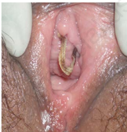
Figure 3. The intravaginal slingplasty sling exposure.