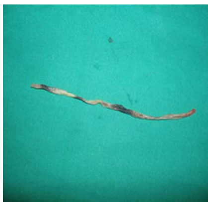
Figure 4. The complete removal of the sling.